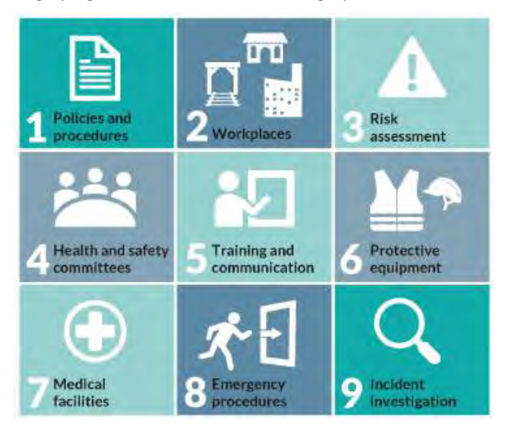
Taken from p. 186 COP 201Guide 9

As already provided for in chapter 7 of this Company Policy, the company complies with the legislation on safety at work, guaranteeing all employees safe and healthy working conditions, according to applicable law and other sector-specific rules, and implementing a program that includes the following 9 points: