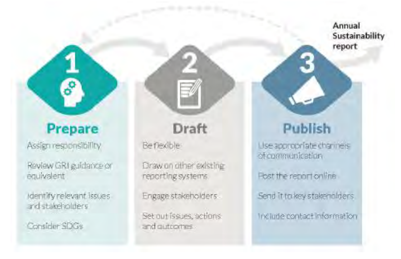
Taken from p. 24: https://www.responsiblejewellery.com/wp-content/uploads/RJC-COP-Guidance-April-2019-IT.pdf