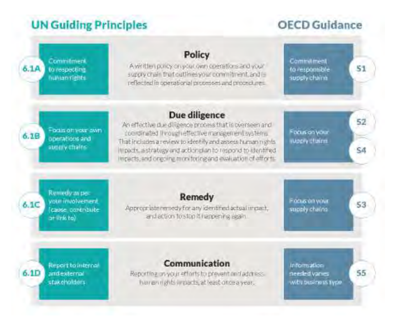
Taken from p. 41: <u>https://www.responsiblejewellery.com/wp-content/uploads/RJC-COP-Guidance-April-2019-IT.pdf</u>

The UN Guiding Principles (and the OECD Guidelines) set out what needs to be done in relation to human rights (to avoid causing negative effects on human rights or contributing to them and then having to be remedied) and suggest how it should be done, defining the human rights due diligence process to be put in place to identify, prevent and mitigate negative effects on human rights and to respond to the way they are addressed.