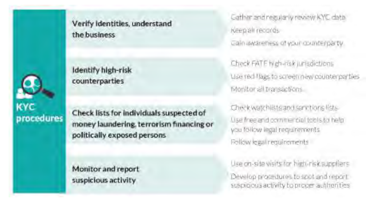
Taken from p. 113 RJC COP Guide 2019

To this end, it adopts the following RJC procedures: